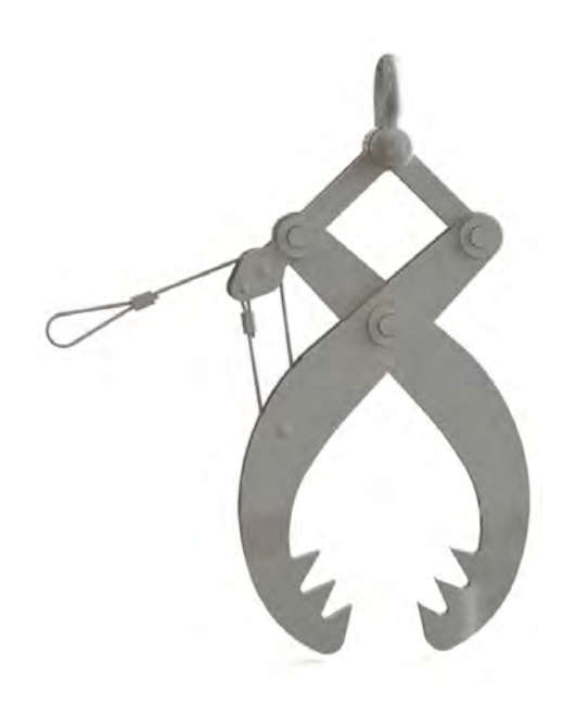
Weight must be completely relieved before tongs can be released.